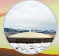
White Sulphur Springs, MT 0.5 MG Ground Storage Tank