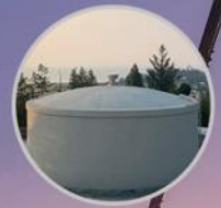
Somers, MT 0.5 MG Ground Storage Tank